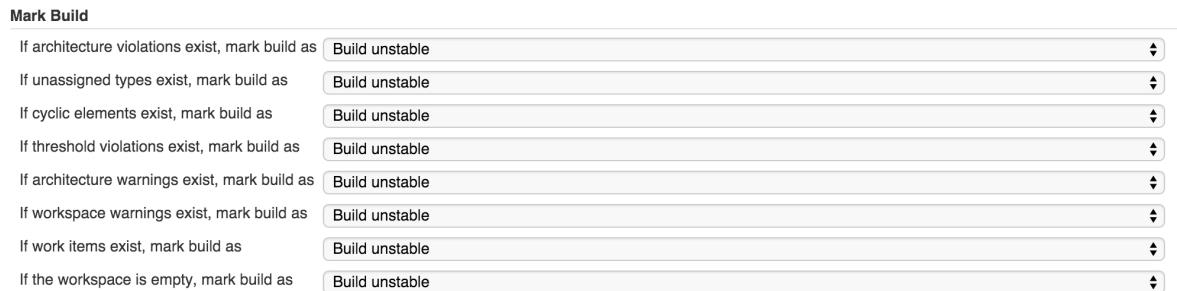
Figure 11.10. Mark build failed or instable

Finally the reasons for marking the build as failed or unstable can be set: