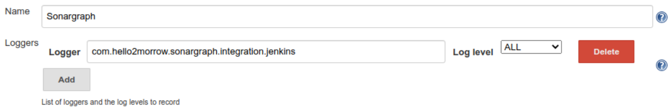
Figure 10.13. Jenkins - Logging Configuration

Now you should have the new log recorder configured like this: