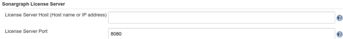
Figure 10.3. Jenkins - License Server Configuration

Sonargraph uses a web-based hello2morrow license server for activation code based licenses by default. If you run your own local Sonargraph license server configure it at "Manage Jenkins" → "Configure System" .